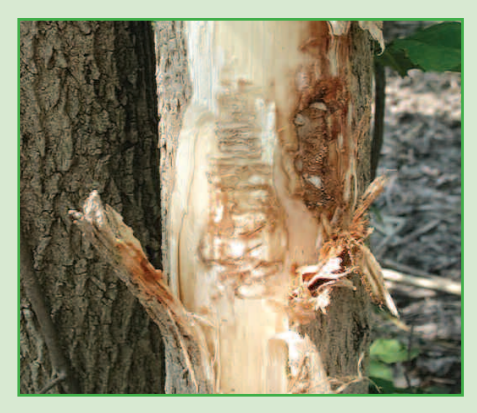
Photo 4: The destructive phase of EAB attack is performed by larvae that destroy cambial tissues in a serpentine pattern.