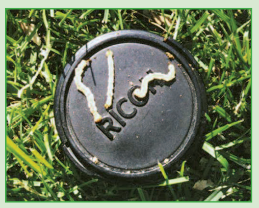
Photo 5: Larvae are segmented and measure over one-inch when mature.