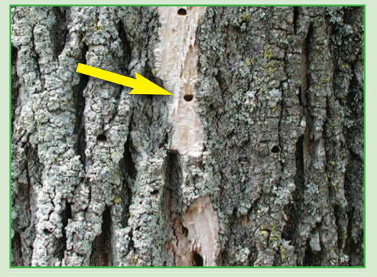
Photo 3: Adult EAB emergence holes are D-shaped (see arrow). Bark has been stripped, and larger jagged holes created, by woodpeckers in search of EAB larvae as food.

Although an expensive government sponsored cut and chip program failed to contain and eradicate the insect from North America, research and field observations have