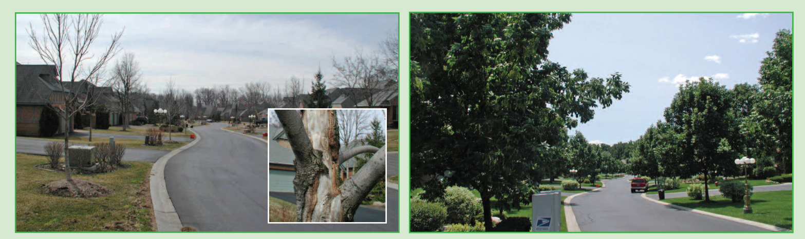
Photo 6&7: The world's oldest and most successful EAB management site in Plymouth, Michigan, near the epicenter of release of the EAB into North America. Photo 6 (left) was taken in 2002 when all ash trees (dormant) were over 90% girdled by EAB activity; note severe cankering (inset). By 2006, all 30 trees had fully recovered and exhibited excellent growth (Photo 7, right), thanks in large part to Arbor Systems Wedgle injection treatments using Pointer. Supplemental nutrients and water augmented the program.