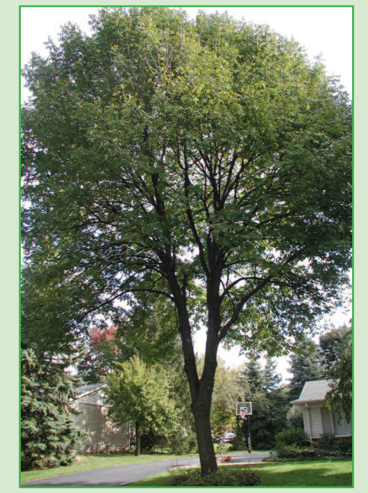
Photo 9: A professional arborist used Mauget injection techniques to successfully protect this focal point ash tree at his residence.

Development of Landscape Tips was sponsored by MSU and MGIA.